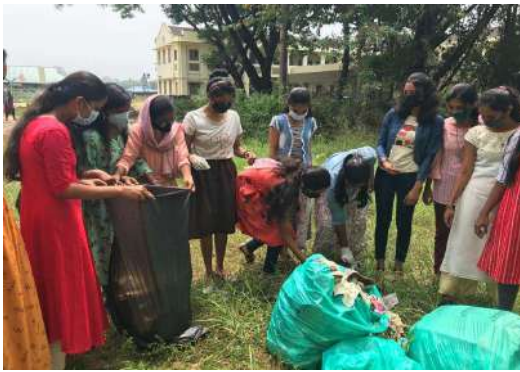
DEPARTMENT OF ZOOLOGY