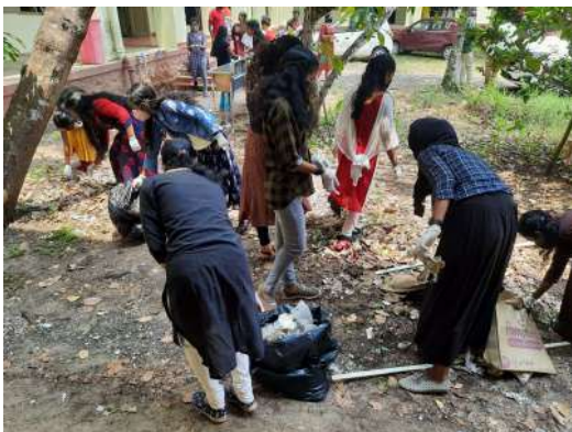
DEPARTMENT OF HISTORY