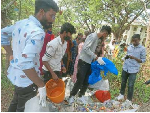
DEPARTMENT OF MALAYALAM