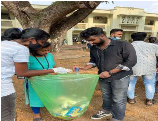
DEPARTMENT OF COMMERCE